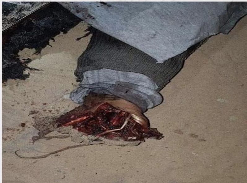
A grenade exploded in the hand of an attacking militant